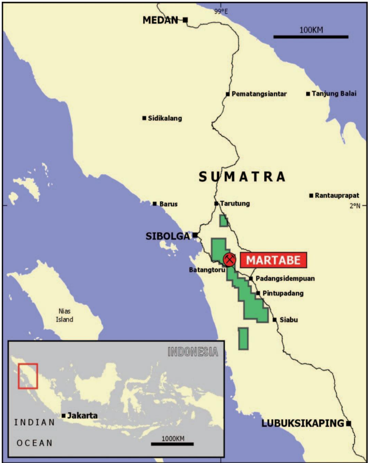
Figure 1. Location of the Martabe site and Contract of Work area, North Sumatra, Indonesia.